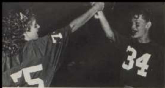
We are just like the big boys we perform for!!!