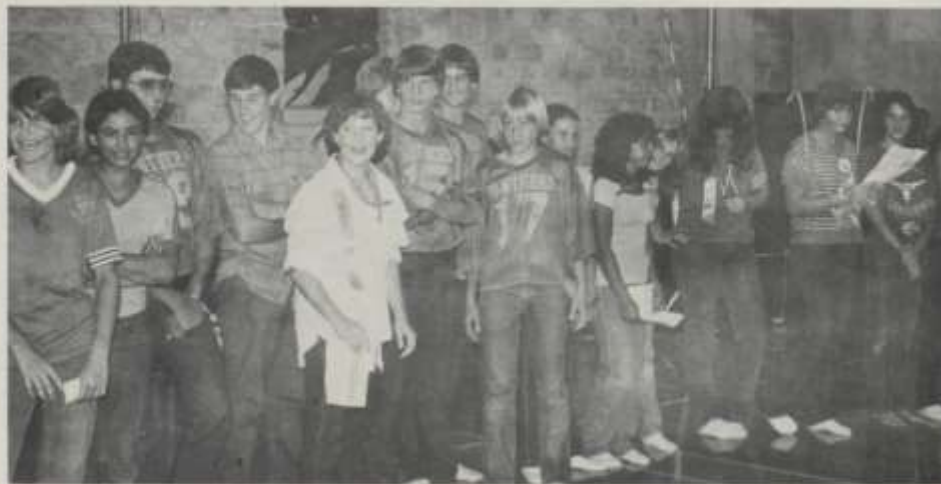
Singing a "Senior Love Song" at the pep rally is just one of the activities for "Fish" during initiation week.