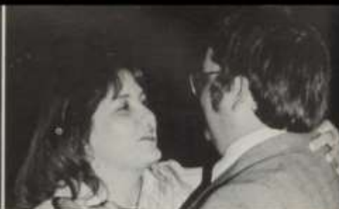
Fellow, YOU know who hold of you now!!!