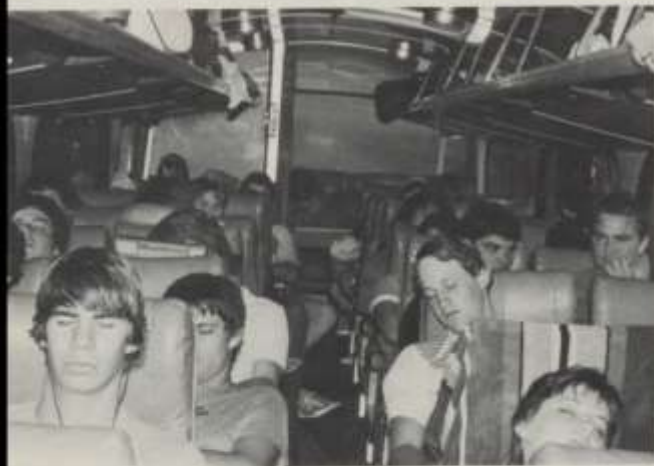
On their way home on Saturday, most of the seniors were really tired. For 42 hours, this bunch spent their last time as a group together in a slap-happy way.