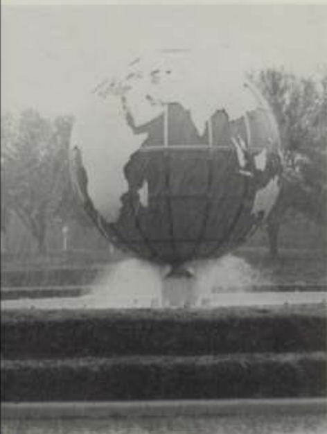
Above: The fountain at Astro World didn't have to spray water. It was getting more from the sky than from the pumps below.