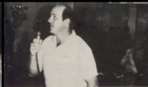
This is what's going on — these guys are great!!!!