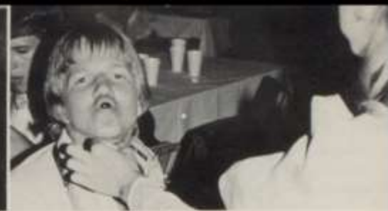
Thanks for getting this stuck grape out of my throat!!!!!!