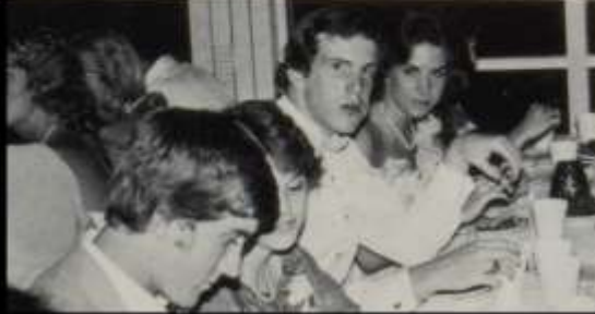
Come on Blondie, Swing out, Swing out!!